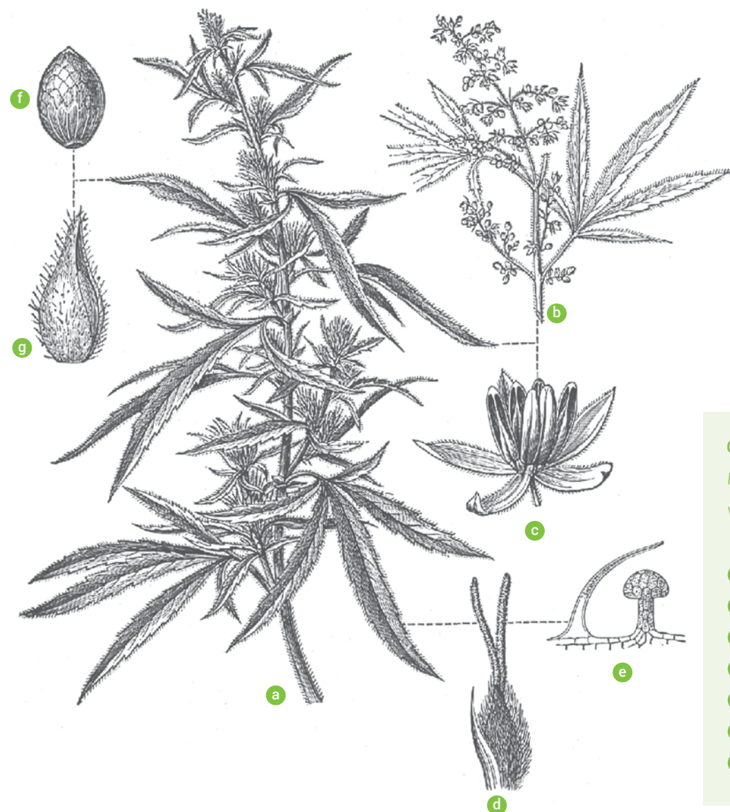
Cannabis sativa Nordic Family (1904), vol.2, Cladding Plants [1]

*These varieties produce juice that falls way below the EU prescribed limit of 0,2% THC, and are all registered in the EU Directorate General for Health & Consumers.